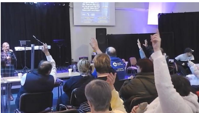
6: Photo of Disability Partnership Calderdale event who held a 'Who Wants to be a Millionaire' style themed quiz to share the 'Together We Can Choose Well' messages.

You can find all materials for the Together We Can Campaign at the following link Home - NHS - Together We Can (togetherwe-can.com)