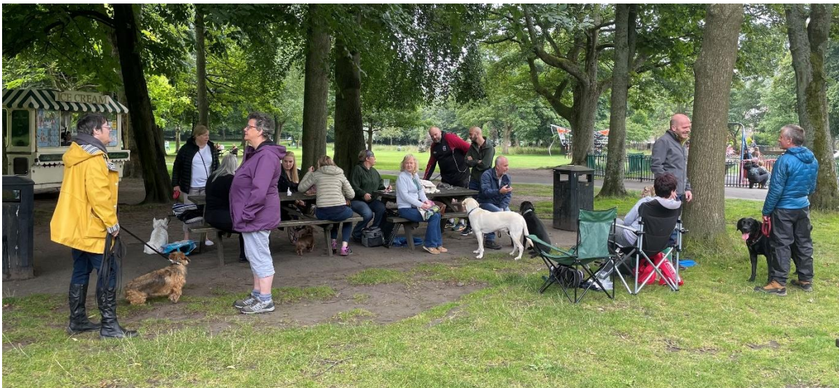
7: Photo of CCG staff picnic in the park event in the summer 2021

The CCG's Staff Forum 'The Voice' has had a key role to play in engaging with staff. This year they have arranged a picnic in the park event in the summer, launched an online feature introducing staff, and a 'cheers from peers' digital board where colleagues could thank each other.